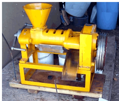
Fig. 2: The one-ton press oil expeller (Anyang GEMCO China)