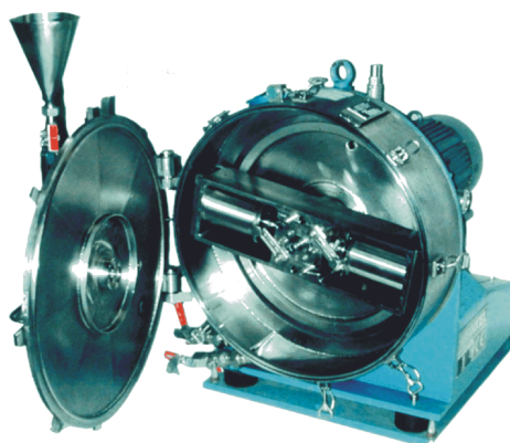
Fig. 3: Two-beaker centrifuge machine (Heinkel Filtering Systems, Inc. USA)

In most small-scale rural situations, this is of little or no importance as the cake that remains after the oil has been removed finds uses in local dishes, in the manufacture of secondary products or for animal feed. Some raw materials however do not release oil by simple expelling; the most notable being rice bran. To remove oil from commodities