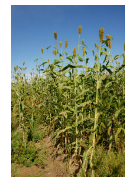
Fig. 1: Sweet Sorghum Plant

Due to low water requirement for cultivation and processing, sweet sorghum can be grown throughout the temperate climate zones of Asia and the Americas.