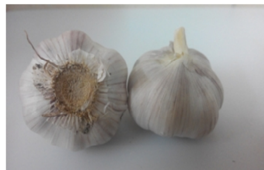
Garlic ( Allium sativum )-1g