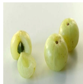
Amla ( Phyllanthus emblica )-3g