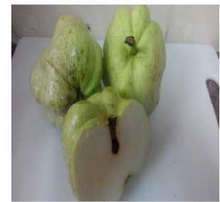
Guava ( Psidium guajava L.)- 10g