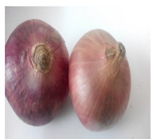
Onion ( Allium cepa )-50g