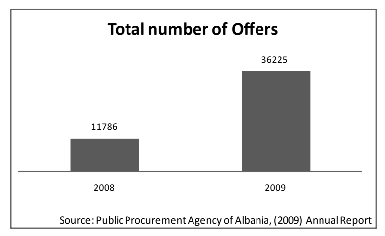
Figure 2. Total number of Offers

Through the on-line publication of these procedures, all economic operators have the opportunity to get informed on procedures of their interest. They may download the complete documentation of the tender and participate in a tender by submitting an offer electronically through their accounts. According to the AmCham Survey, 91% of Tirana-based businesses and 77% of those outside Tirana use their company's office to interact with EPS. Number of bidders from paper based procedures to electronic procedures has increased from 2.3 to 7.7 bidders. This is one of the strongest impacts of using e-procurement system in Albania. Again, a comparative view, especially between number of bidders in 2008 and 2009, which is the first year of application of EPS, makes clear the difference<sup>22</sup>. The following graph presents the total number of bids in the Public Procurement Agency website in 2009 compared to 2008.