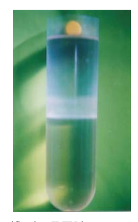
Figure 1. Purification ILTV by sucrose gradient centrifugation. A single band was obtained by density gradient centrifugation in 20-60% sucrose, centrifugation 200,000 x g for 5 hours at 4°C

The results of the spectrophotometric readings showed that the vaccine strain had the highest protein content at 0.7400 mg/mL. Concentration of the ILTV isolates from highest to lowest were # VI-C28 at 0.6486 mg/mL, isolate #VI-C30 at 0.5871 mg/mL, isolate # IV at 0.5142 mg/mL, isolate # VI-C29 at 0.4421 mg/mL and isolate #VII-7 at 0.1807 mg/mL. All ILTV isolates had the right concentration necessary for SDS-PAGE studies. These studies require a concentration of 0.5 to 5 µg per lane (20µL) in order for the protein to be detected by coomassie blue staining (WILSON, 1983).