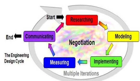
Figure 1. Engineering Design Cycle [8]

Figure 1 shows the Engineering Design Cycle which has five stages. These are researching stages,