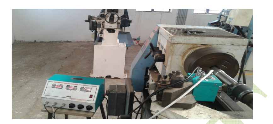
Figure 1: Lathe Maxcut PRH175