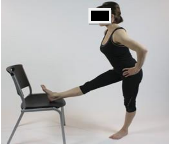
STANDING HAMSTRING STRETCH

15 seconds. Only 18 patients were left at the end of study as 7 patients were excluded from the study due to