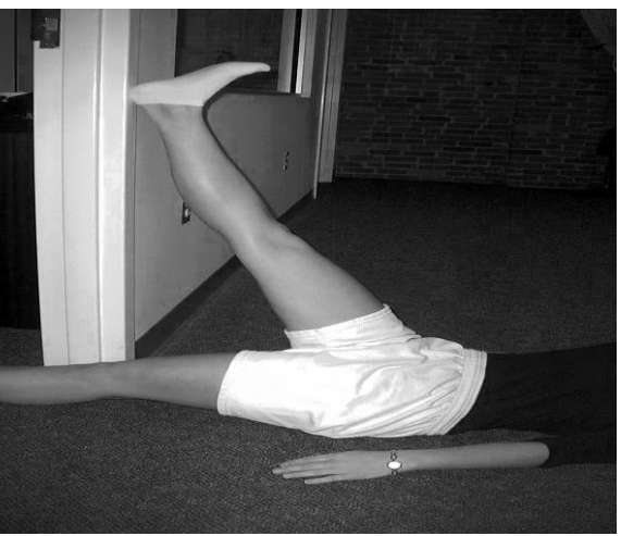
SUPINE HAMSTRING STRETCH

discontinuation of stretching procol. The whole study was conducted at NIMS medical college, Jaipur.