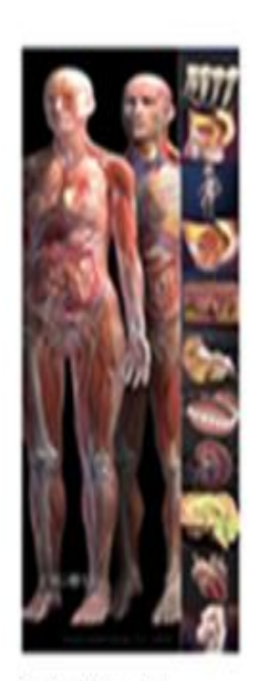
For the Whole Body Medical Education/Profession Medical Colleges: 381 Medical Council Of India (MCI)