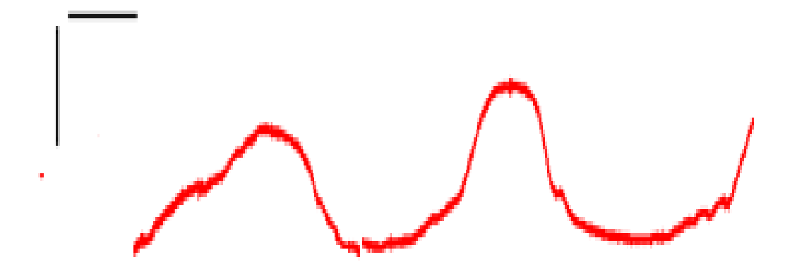
Fig 2. Actual recording of spontaneous contractions obtained from a colonic strip of pre-atretic part of colonic atresia. Vertical and horizontal calibration represents tension (1 g) and time (5 min) respectively.