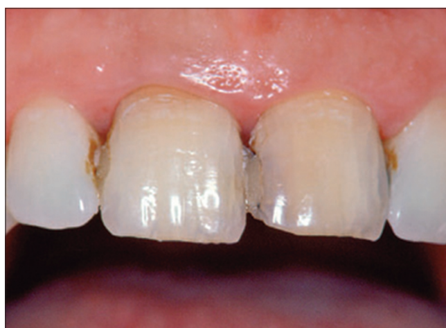
Figure 2: Enamel craze lines

used core materials for such restorations. It has been used as a direct restoration because of many clinical, practical, and ergonomic advantages of providing the optimal marginal seal, wear resistance and compression strength along with good polishability and excellent costs-benefits ratio. [13] The disadvantages of amalgam being long setting time, corrosion reaction and base metal alloy due to galvanic activity and the prevention of natural tooth translucency, in conjunction with ceramic crowns. [10]