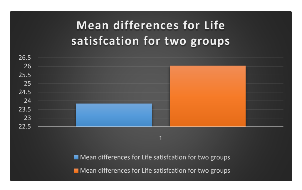
Chart no 1

Hypothesis 3: There will be significant difference between the level of Resilience among women divorced for less than 5 years and women divorced for more than 5 years.