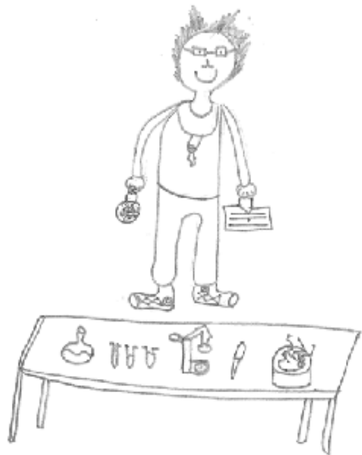
Figure 2: Happy scientist.

Nowadays, scientists usually work in groups. A team of research scientists may come from different countries and include both genders and all ages. Out of 520 drawings, only 8 showed a scientist working in some kind of group; all the others showed a man/woman working alone. To understand the work done by scientists, student should learn that much of it depends on shared information and focused interaction with peers.