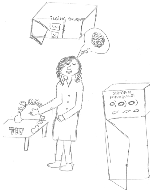
Figure 3: Woman scientist working with time machine.