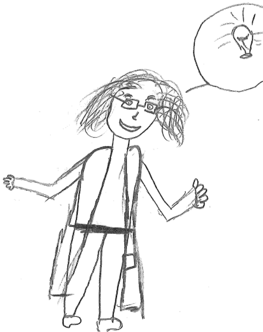
Figure 1: Smiling scientist.

Among the 520 images drawn by students in grades 5-8, the majority depicted male scientists. Although 53% of the participating students were female, only 13% of the drawings were of female scientists.