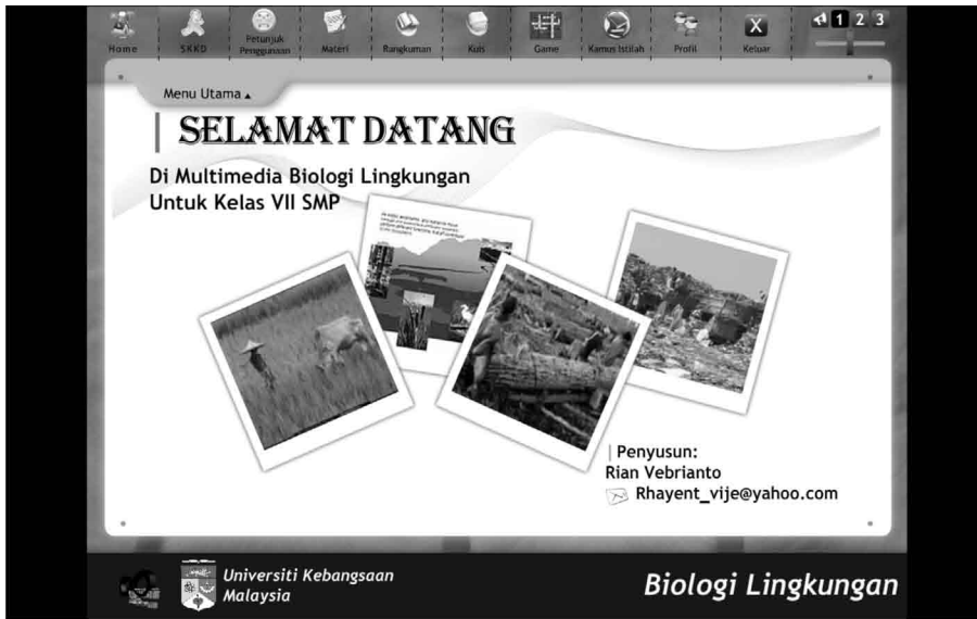
Figure 2: Main menu.

The content structure for the development of the environment based module is shown in Figure 3 below. On the other hand, the second experimental group underwent truly environmental learning experience while the control group learnt the same topic using conventional teaching methodology.