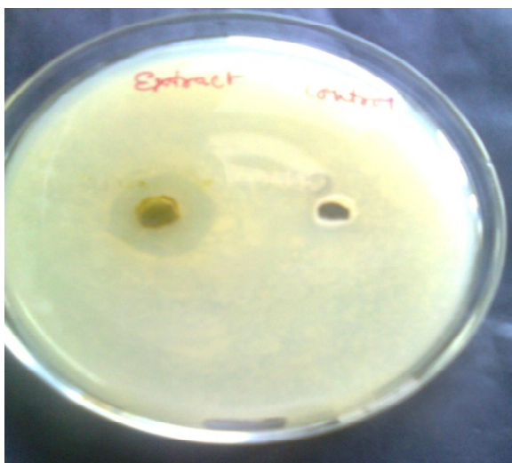
Fig. 5 : Zones of growth inhibition around disks impregnated with Ag NPs against pathogenic E.coli

The stability of Ag NPs is observed for 2 months and it shows an absorbance peak at the same wavelength. The SEM image of silver nanoparticles synthesized using Saraca asoca leaves and 2mM silver nitrate is shown below. The Ag NPs are monodispersed with star & cuboids' shaped. The average size of the particles is between 30-60 nm. Some Ag NPs showed size of approximately below 60 nm. A few agglomerated particles are also observed due to the spectral shift.