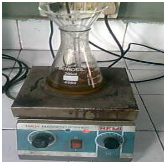
Fig. 2 : Color change of leaf extract after 1h incubation

Plasmon Resonance phenomenon as compared to the tube with only plant extract which shows Green color.