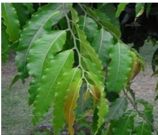
Fig 1. : Saraca asoca Plant leaves

Saraca asoca plant leaves were collected from the small village Chilka situated in Latur district,