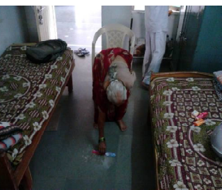
Fig. 2: Berg Balance Scale.

Then the subjects were asked to perform Timed Up and Go Test. The total time taken to complete the task was noted down in seconds. The subjects who take longer than 14 seconds to complete this task were considered to have a poor functional balance (i.e. high risk of fall) [13].