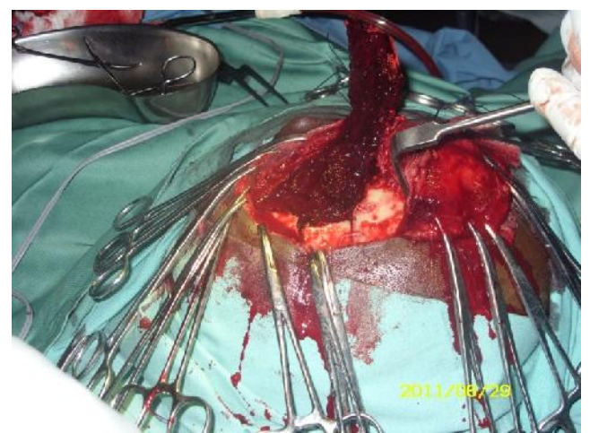
Figure 5: Extradural hematoma from a patient hit with motorcycle exhaust pipe.

On discharge, they were followed up in surgical out-patient clinic and by phone. The functional outcome was assessed with Glasgow