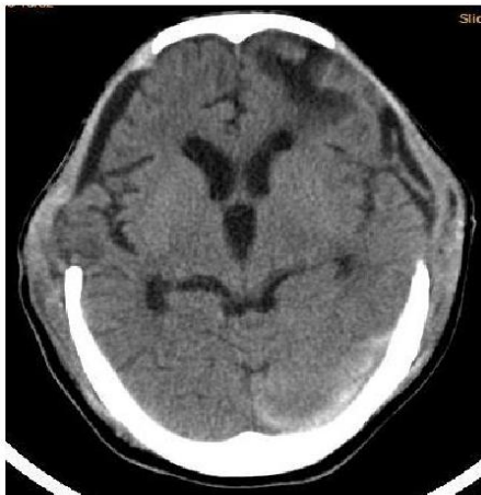
Figure 2- Axial CT scan of brain with bilateral calvarial defects at the time of discharge from the hospital. Noted on the left frontal region is the loss of parenchyma and bilateral subdural hygromas and mild dilatation of ventricular system.