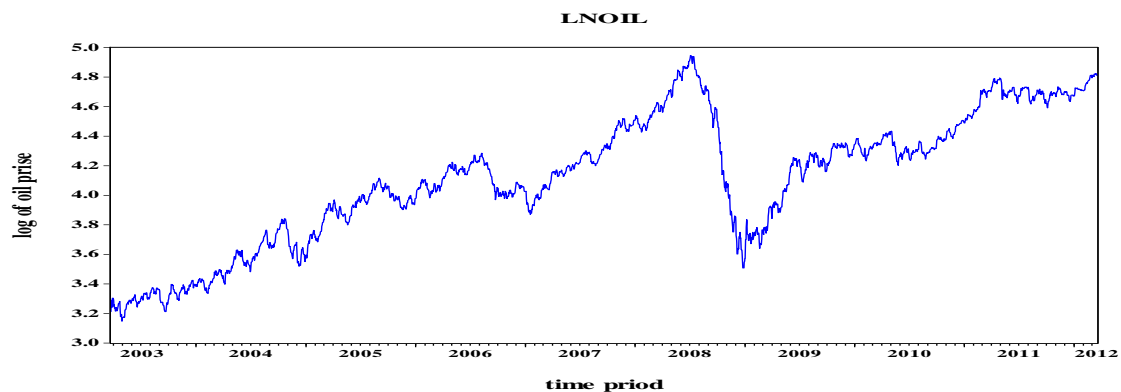
Figure 2. The natural logarithm of the oil price