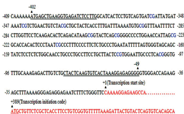
Fig.1: Schematic view of primer positions in the Egf promoter region. Primers designed for Bisulfite Sequencing PCR (BSP) by MethPrimer software and 10 CpG sites close to transcription start site are located in the -49 bp to -402 bp of the Egf promoter region. A 354 bp fragment was amplified by the BSP primers. Egf ; Epidermal growth factor and PCR; Polymerase chain reaction.

The 1000 bp sequence of rat Egf promoter region was input to MethPrimer software (30) for bisulfite sequencing primer design. The primers used were 5'-ATGAGTTGAAGGTGAGATTTTTTTG-3' (sense), and 5'-CCCCTCTCCTTAATAACACTTAAATAA-3' (antisense), which covers 354 bp from -49 to -402 from the transcription start site, with 10 of CpG sites in the Egf promoter region (Fig.1). DNA (500 ng) was modified with sodium bisulfite using EpiTect Bisulfite kit (Qiagen, Germany). Polymerase chain reaction (PCR) was performed for 40 cycles: 95^\circ\text{C} for 30 seconds, 56^\circ\text{C} for 30 seconds, and 72^\circ\text{C} for 30 seconds. Amplified bisulfite-sequencing PCR products were purified using the PCR purification kit (Dingguo Company, China) and inserted into pMD18-T vector (Takara Co., Dalian, China). The vector was then transformed into competent JM109 E. coli cells and 10 of positive clones were sequenced in each sample.