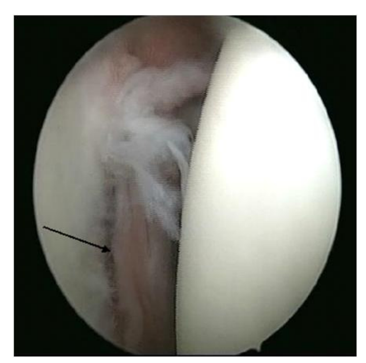
Figure 1. Arthroscopic image presenting a Bankart lesion (arrow).

techniques evolved from previously wide spread use of open surgical repairs of the glenoid labrum. Permanent shoulder stability is expected following arthroscopic surgery, similarly to the classic open techniques, but with considerably lower surgical morbidity.