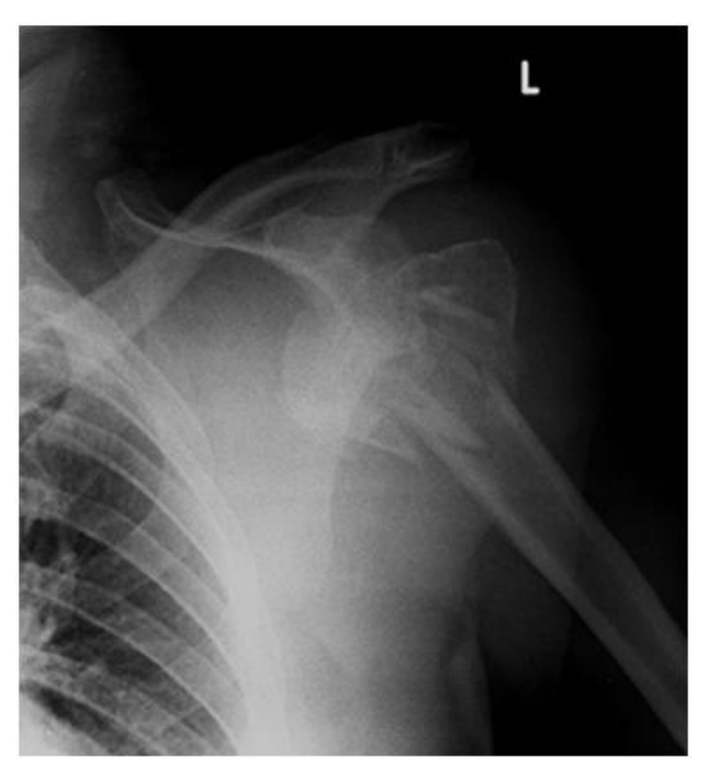
Figure 4. Anterior-posterior radiograph of left shoulder(41 years old man) demonstrating comminuted fracture of head of the humerus in addition to its anterior dislocation.

positive. It should be noted that pain evoked in this position might be related to subacromial impingement syndrome or other pathology, therefore, in order to reduce the chance for misdiagnosis, the examiner should