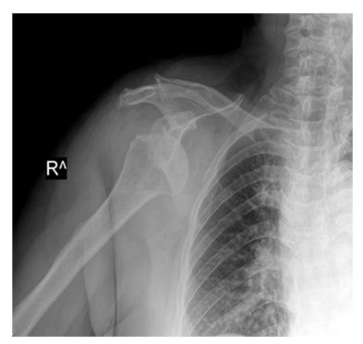
Figure 3. Anterior-posterior radiograph of right shoulder in 70 years old woman demonstrating anteriorly dislocated humeral head.