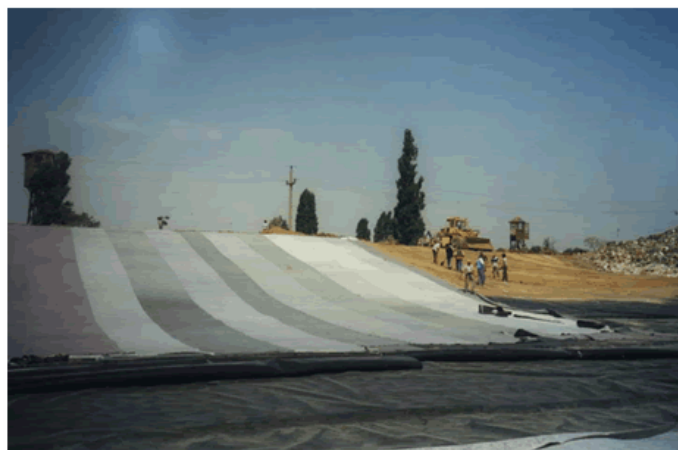
Fig. 1. Compartmental dam.

The sealing layers from synthetic materials (polyethylene geomembranes of high density – PEHD and the relevant drainages are performed following the diagram presented in fig. 2).