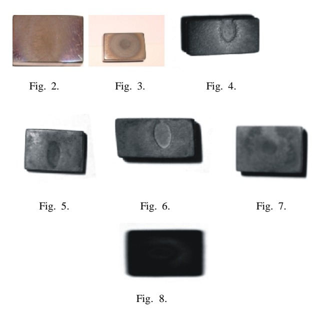
A. X-Ray diffraction analysis (XRD)

Photographs of uncoated and coated Samples shown in Fig. (2), (3), (4), (5), (6), (7) and (8) shows photographs of the samples SS-304 Uncoated, SS-310 Uncoated, SS-304 Cr coated and SS-310 Cr coated.SEM morphologies for the plasma sprayed Cr coatings on SS-304 and SS-310 are shown in Fig. 9. From the micrographs the coating layer can be clearly seen. For the as sprayed plasma coatings the middle one represents the coating layer, left one represents the epoxy and right one represents material. Presence of some open pores as well as oxides has also been noticed in all the coatings.