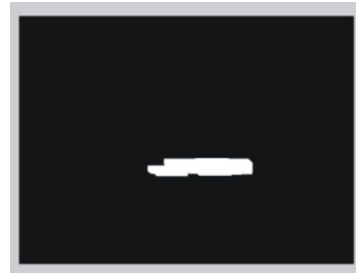
(a) Plate region

The binarized image is then processed using some methods. To find the plate region, firstly smearing algorithm is used. Smearing is a method for the extraction of text areas on an image. With the smearing algorithm, the image is processed along vertical and horizontal runs (scan-lines). If the number of white pixels is less than a desired threshold or greater than any other desired threshold, white pixels are reconverted to black. In this system, threshold values are selected as 10 and 100 for both horizontal and vertical smearing. Else; no change. If number of 'white' pixels > 100 ; pixels become 'black' Else; no change. After smearing, a morphological operation, dilation, is applied to the image for specifying the plate location. However, there may be more than one candidate region for plate location. To find the exact region and eliminate the other regions, some criteria tests are applied to the image by smearing and filtering operation. The processed image after this stage is as Fig. 2 (a) and (b) image involving only plate follows: