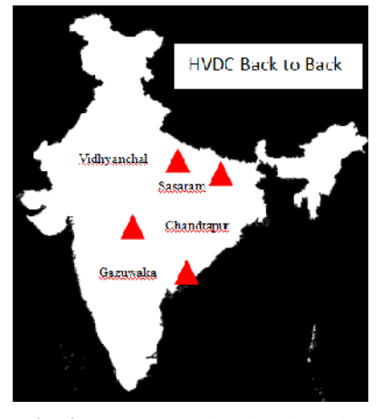
Fig. 3. HVDC Back to back Stations.

There are currently four operational back to back projects in India namely, Vidhyanchal Back to Back, Chandrapur Back to Back, Sasaram Back to Back and Gazuwaka Back to Back.