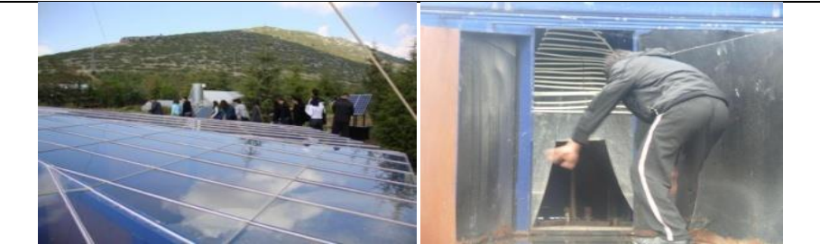
Journal for the Education of the Young Scientist & Giftedness, 2013, 1/1