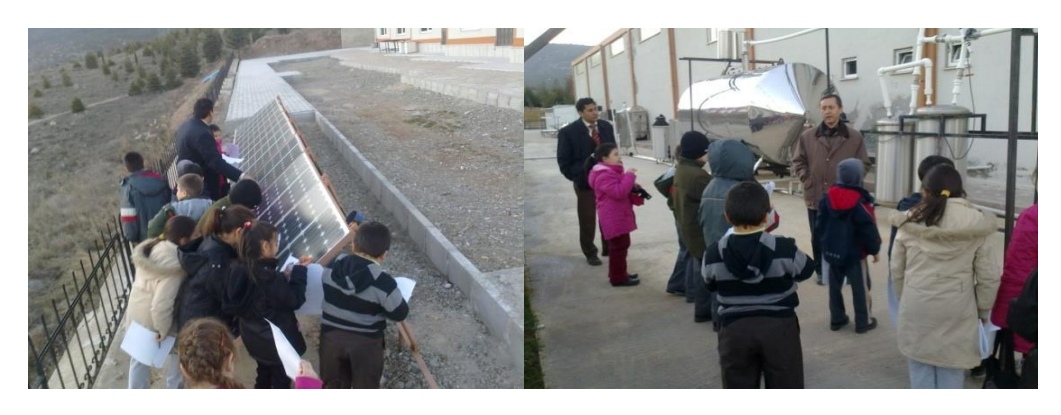
Figure 2. Examining of clean energy house and biogas plant by students at S.D.U. (Tortop, 2012a)

12 Meaningful field trip in education of the renewable energy technologies