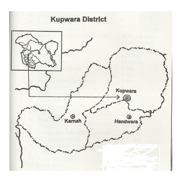
Fig. 1. Map showing location of district Kupwara in J&K State.

census villages, comprising of two Municipal Committees, three Tehsils and eleven Community Development Blocks with many areas like Machil, Teethwal, Keran, Karnah etc situated on Line of Control (LoC). Kishanganga is the important river originating from Himalayan range, flows through the outer north-east areas of the district from east to west. It passes through Keran and Teetwal areas and finally merges with river Jhelum at Domail in Muzzafarabad (Anonymous, 2001).