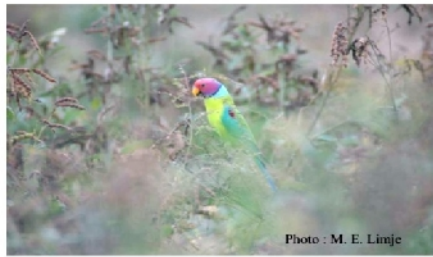
Plum-headed Parakeet Psittacula cyanocephala (Linnaeus)