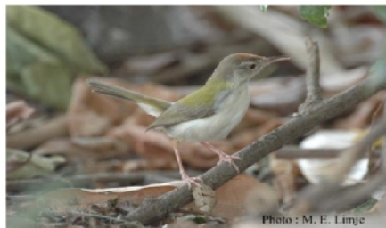
Common Tailorbird Dicrurus caeruleus (Linnaeus)