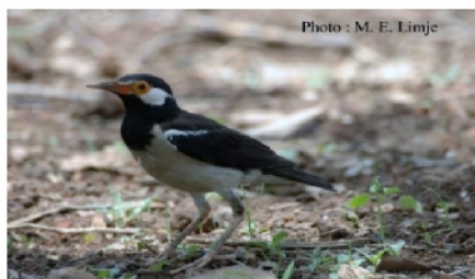
Asian Pied Starling Sturnus contra Linnaeus