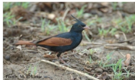
Crested Bunting Melophus lathami (Gray)