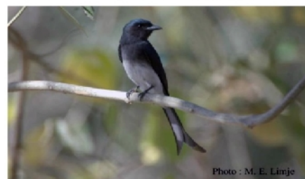
White-bellied Drongo Orthotomus sutorius (Pennant)