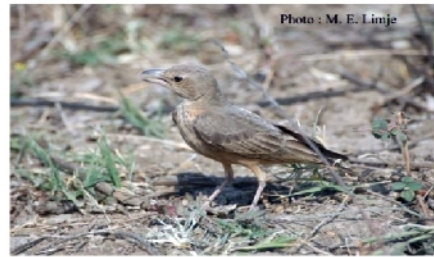
Rufous-tailed Finch-Lark Ammomanes phoenicurus (Franklin)