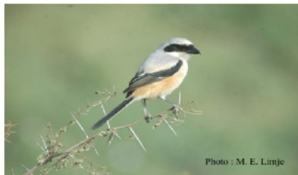
Rufous-backed Shrike Lanius schach Linnaeus