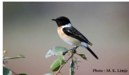
Common Stonechat Saxicola torquata (Linnaeus)