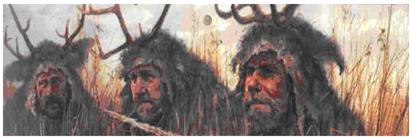
Fig. 5a. Men animals