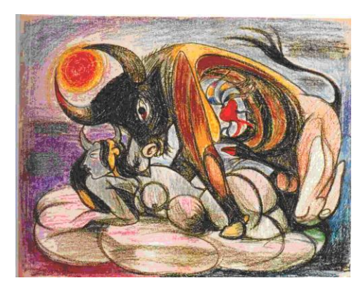
Fig. 9a . The Lion of Babylon