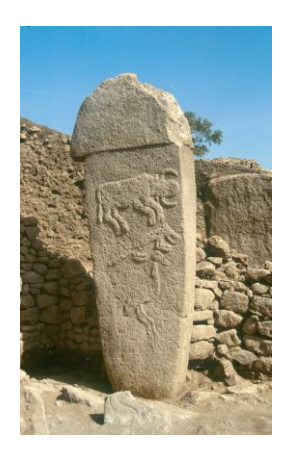
Fig. 8. Gobekli-Tepe

The origins of such rituals connected with the victory of man-animal over man-hunter can be traced in theatrical action. The audience felt that women had to copulate with an animal, not with a man. Initially, this was percei-