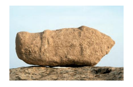
Megalith from Gobekli-Tepe, Turkey