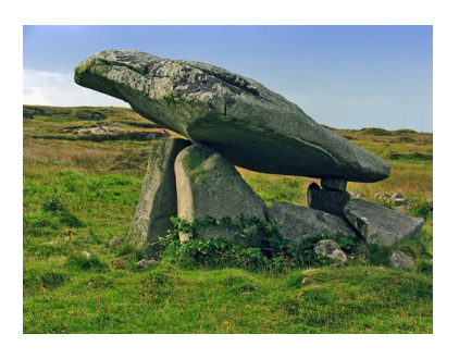
Kilclooney Dolmen (Ireland)

When man became civilized, there appeared a gap between the symbol and the symbolized, and megaliths turned into an end in itself and a tradition for subsequent generations. Every generation created its "megaliths". Their original purpose was forgotten. They transformed into ziggurats, pyramids, theatre buildings, stadiums, etc. They were used for burials, worship, entertainment, etc. All the spiritual practices that evolved around the megalithic structures required a high level of abstract thinking, which was not inherent in man during the transition from human-animal to civilized man. Speaking of the initial purpose of megaliths, we mean the state of human consciousness,