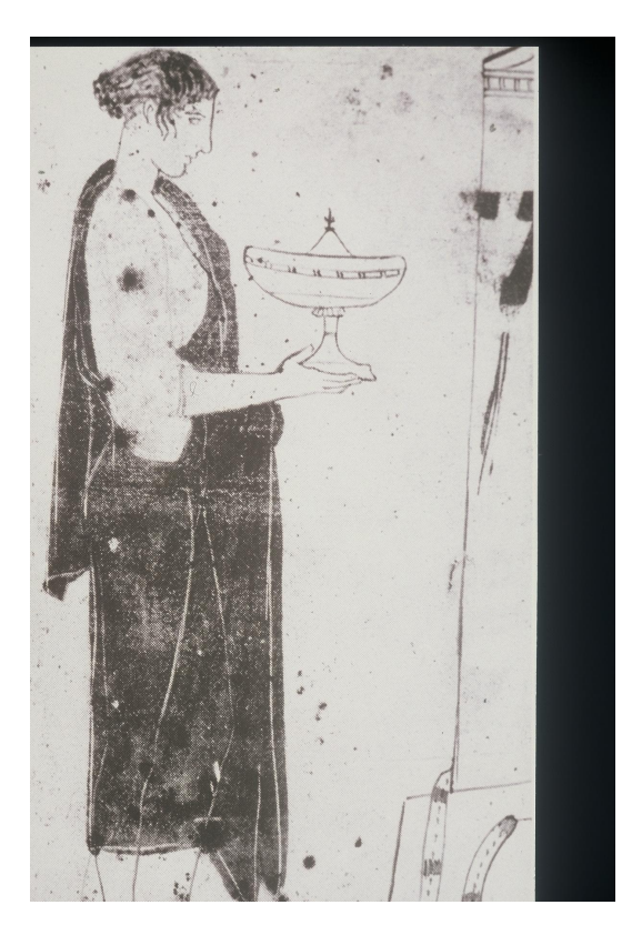
Fig. 7. A black-clad woman with offering at a decorated tomb, funerary whitegound lēkythoi National Museum, Athens 1991

To care for the graves is a duty which falls on the descendants, officially the male citizens, but in practical life, we see the predominance of women on funerary white-gound lēkythoi deposited in or on the grave thus, confirming their critical role in the tendance of the dead and the family grave (Fig. 7). The same reality is attested in the tragedies and later in Plutarch. The tragedies constitute a particularly important category of sources telling about the death, burial and following rituals in the domestic or family sphere. In the opening sequence of Euripides' Orestes , Orestes has killed his mother Klytaimnestra. Her sister, Helena, sends her daughter, Harmonia, to perform the ritual libations at the grave of her sister (Eur. Or. 112–124).