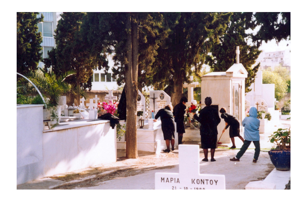
Fig. 4. A "female sphere" in a public space: the cemetery, a space controlled by women, Athens 1<sup>st</sup> cemetery a Saturday morning, winter 1991.