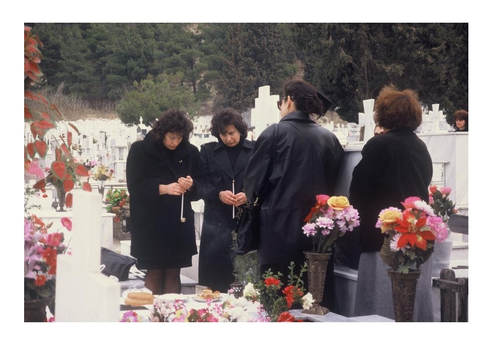
Fig. 6. Memorial service performed for a deceased person with offerings of food at the tomb on the second of the three psychosabbata , i.e. All Souls' Day, during Carnival and Lent, at the end of the winter, 7 March 1992, Serres (Greek Macedonia).

6). The food is blessed by the priest. Afterwards, it is passed round and eaten, so that the souls of the dead may be forgiven. Some of the food is left on the graves as offerings. Some people assume that the souls of the dead are set free by sacrificing hens-blood on the graves. At the ancient animal sacrifices, the victim was also killed so that the blood would flow into the earth and appease the souls of the dead. But it is also a sacrifice to the underworld accompanied with a prayer for a bountiful harvest, and might be compared with the way Odysseus by a similar sacrifice came into contact with the seer Teiresias in the underworld, Hades ( Od. 11). According to Homer, a person became a clairvoyant in the moment of death, and by being nourished with blood from the earthly world the dead could answer the questions of the living. Today, the bloody death of the sacrificial animal next to the tree, ensure the continuity of the vegetable life, such as in the village of Agia Elenē.