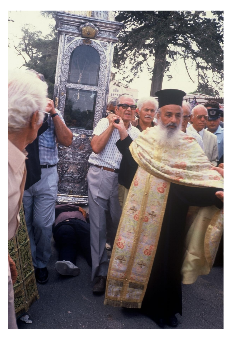
Fig. 1. During the procession at the festival dedicated to Agios Gerasimos on the island of Kephallonia, his relics are carried in procession and also over the sick, 16 August 1992

paralleling the annual burial procession with the death-bed of Adonis in ancient Greece and Egypt (Theoc. Id. 15.132–142). Will a closer examination of the modern Greek death-cult in comparison with its ancient parallel clarify these contemporary political phenomena in the Mediterranean area?