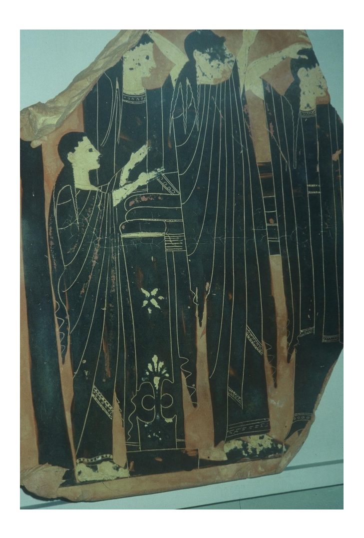
Fig. 3. Mourning women surrounding the bier. Fragment. National Museum, Athens, 1991

the immediate mourning, when the closest family-members were tearing their hair; the men threw themselves on the ground and soiled themselves, and the women threw themselves on the dead. Then, followed the washing and preparation of the corpse for its display at the wake. The women had the leading role in these rites, which were followed by the formal lament during the funeral prothesis , the "laying out of the corpse" or wake, which might be led by women and men, while the final burial ceremony was led by men.<sup>12)</sup>