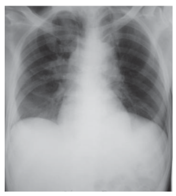
Figure 5: Control PA chest X-ray after antibiotics.

was sent for microbiological examination. Blood cultures where cultivated in the automated BacT/Alert system using both anaerobe and aerobe liquid media. The instrument indicated positive cultures after the 24 hourincubation. Gram staining of the liquid cultures revealed short Gram-positive bacilli. The blood cultures were subcultured on the blood agar and MacConkey agar in aerobic conditions and on Shaedler agar in anaerobic conditions. After 48h of incubation on the blood and Shaedler agar, a noticeable growth was registered. Colonies were small, smooth and slightly whitish. Gram stain of the culture revealed Gram-positive short rods resembling diphteroids in pattern. The oxidase and catalase tests were performed, producing a negative