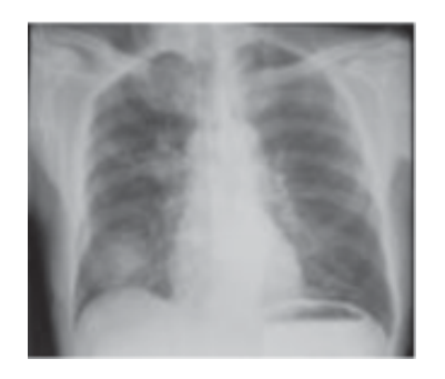
Figure 4: PA chest X-ray with pneumonic shadow.

was sent for microbiological examination. Blood cultures where cultivated in the automated BacT/Alert system using both anaerobe and aerobe liquid media. The instrument indicated positive cultures after the 24 hourincubation. Gram staining of the liquid cultures revealed short Gram-positive bacilli. The blood cultures were subcultured on the blood agar and MacConkey agar in aerobic conditions and on Shaedler agar in anaerobic conditions. After 48h of incubation on the blood and Shaedler agar, a noticeable growth was registered. Colonies were small, smooth and slightly whitish. Gram stain of the culture revealed Gram-positive short rods resembling diphteroids in pattern. The oxidase and catalase tests were performed, producing a negative