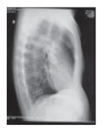
Figure 2: Profile chest X-ray at the first day of hospitalization.

diameter localized in the right upper lobe, with adjacent reactive pneumonitis and a few micronodular subpleural lesions contralaterally, the 9<sup>th</sup> rib fracture with infiltrated pleura and subpleural fat tissue, as well as enlarged retrocaval, bronchopulmonary lymph nodes on the right, and those in the subcarinal region (Figure 3).