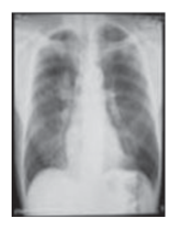
Figure 1: PA chest X-ray at the first day of hospitalization.

A 62-year male patient was admitted to hospital to enlighten the etiology of the lesion presented on his chest X-ray, localized in the right upper lobe. He reported a two-month history of back pains, fatigue, exhaustion, appetite and body mass losses (8 kg in two months). Having noticed a tumorous lesion on the patient's chest X-ray (Figure 1, 2), chest computed tomography (CT) was performed delineating an infiltration of 27 mm in