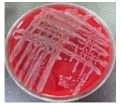
Figure 2: Culture on Columbia agar.

The collected specimen was used for Gram stain and culture. A direct gram-stained smear from wound specimens was performed at the time of culturing, and only 5-10 leukocytes per field were observed. No bacteria were detected. Gram stain didn't correlate with culture results. Both aerobic (Columbia agar) and anaerobic cultures (Schaedler