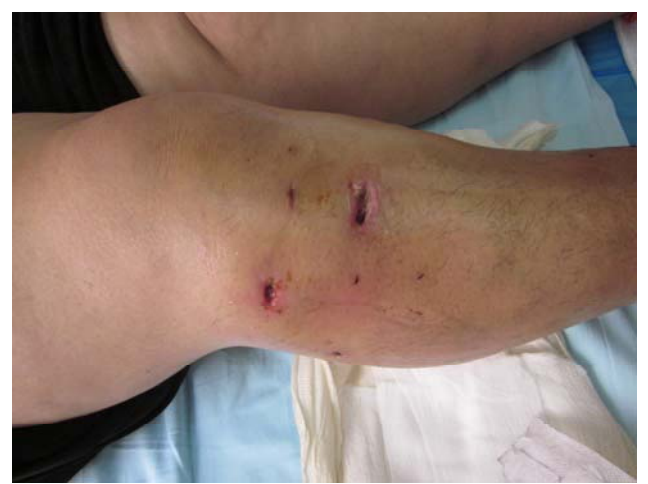
Figure 1: Wound presentation 4 days after dog-bite.

The next control (after 4 days) showed even greater progress (Figure 1).