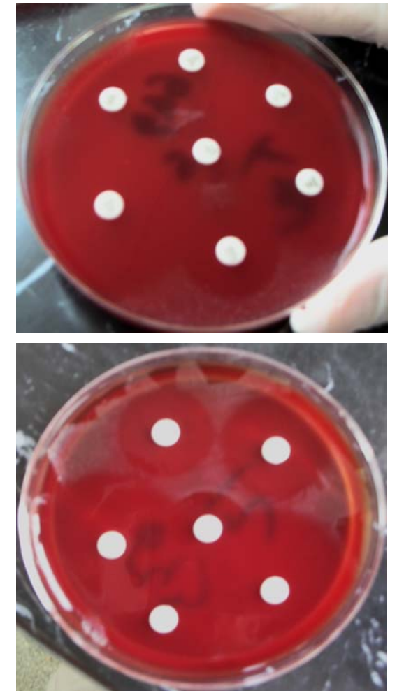
Figure 4: Susceptibility testing on Columbia agar.

and were also oxidase positive with the paper strip (Oxoid, UK) method. Antibiotic susceptibility testing was performed on Mueller-Hinton agar and very poor growth was observed. Another susceptibility testing was performed on Columbia agar (Oxoid, UK) and the growth of greyish colonies was observed. The bacterium was susceptible to all tested antimicrobial agents (beta-lactams: amoxicillin-clavulanate, piperacillin-tazobactam, imipenem, meropenem, cefuroxime, ceftriaxone, cefotaxime, ceftazidime, cefixime, cefepime; aminoglycosides: gentamicin, amikacin; quinolones: ciprofloxacin and COtrimoxazole) (Figure 4). After 48 and 72 hours anaerobic cultures was checked if the growth of some anaerobic organisms appear. Sabouraud medium was also observed after 3 days of incubation. Neither anaerobic bacteria nor yeasts were present in both media. On anaerobic cultures only the identical colonies as on Columbia agar had grown.