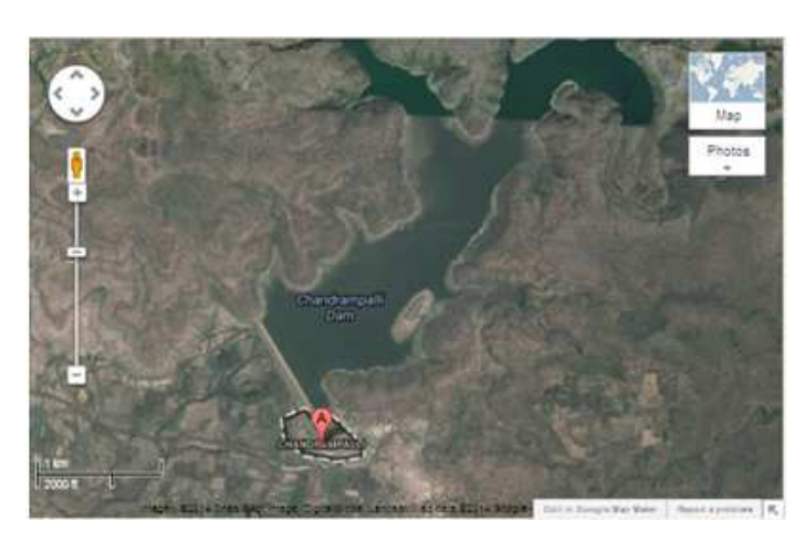
Figure 1: Map of the Study Area