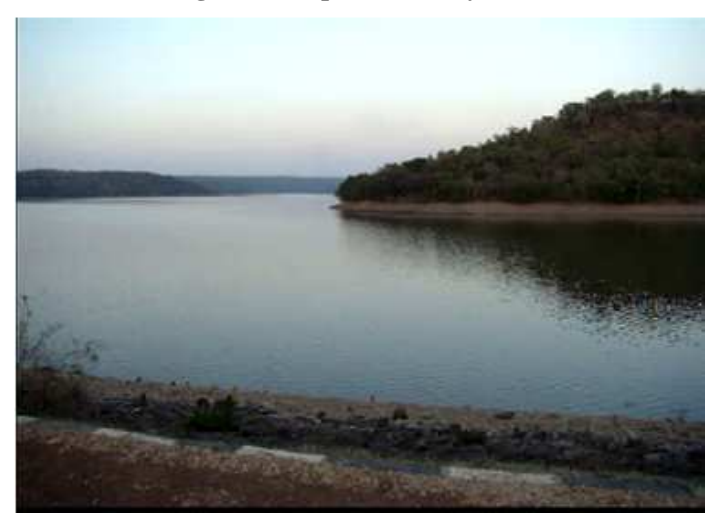
Figure 2: Chandrampalli Dam