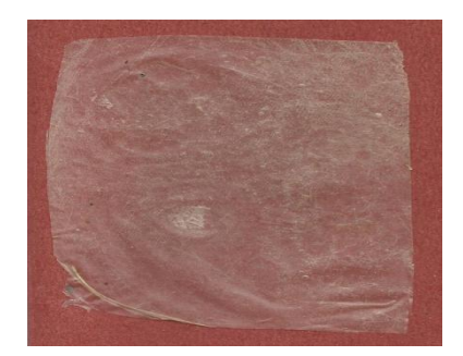
Figure 2: Chitosan Based Film

The chitosan slurry containing glycerol and tween was poured in the petridish and dried at oven to get a flexible film. The dried chitosan based film was shown in figure 2.