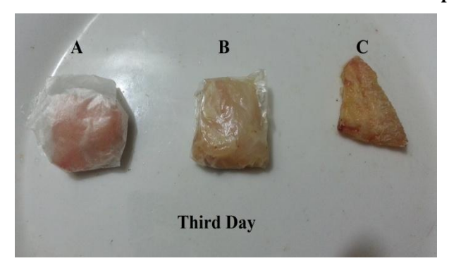
Figure 4A: Represented that Fish Fillet was Wrapped with Chitosan Based Film, 4B Represented that Fish Fillet was Wrapped with Plastic Cover and 4C – Fish Fillet was without Wrappers