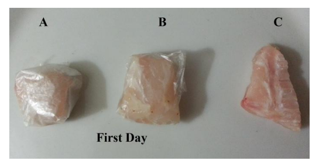
Figure 4: The Fish Fillets were Covered with Different Wrappers

The three pieces of the fish cubes (5g each) were washed and marked as A, B, and C. The fish piece A was wrapped with chitosan based film, Fish piece B was wrapped with plastic cover and fish piece C was without any wrappers. All were incubated at Room temperature and the physical changes were observed. The fish piece wrapped with plastic cover and without wrapper were shown the thin layer of yellow color molds on the surface while the fish piece covered with chitosan based film was shown no changes.