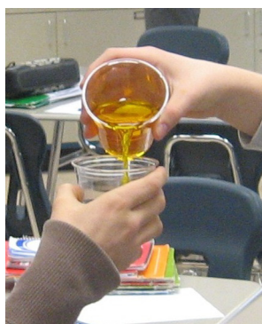
Figure 1: Bodum Santos™ Vacuum Coffee Pot used in the heat/work lesson (left) and students engaged in the “Molecular Mixing” activity (right).

A vacuum coffee pot relies on the conversion of mechanical energy into heat and pressure-volume work (Figure 1). This apparatus has a completely open, hands-on process, making an ideal example for the front of the classroom. The brew process initiates by heating water in the lower chamber (e.g. via Bunsen burner). The water expands and rises into the upper chamber. Prior to this, the Fellow passed out some brewed coffee to catch the students’ attention and then presented a quiz to gauge the students’ prior knowledge of the target content (Table 1).