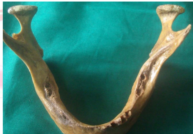
Fig. 2: Showing retromolar foramen on left side.