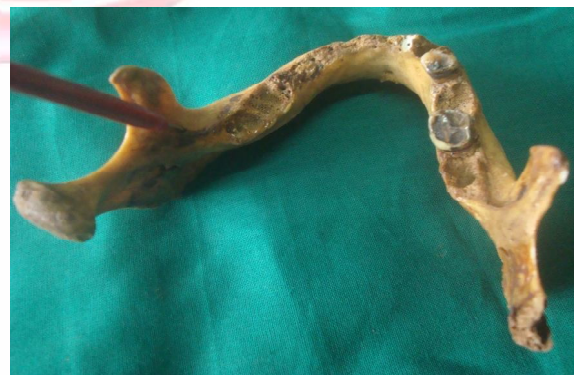
Fig. 3: Showing retromolar foramen on right side.