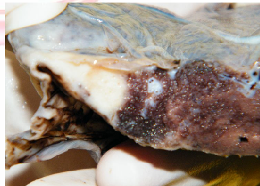
Fig. 5: Cross section of placenta showing area of calcification.