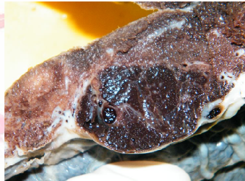
Fig. 4: Cross section of placenta showing area of white infarction.