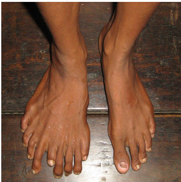
Fig.1: Photograph comparing both feet.