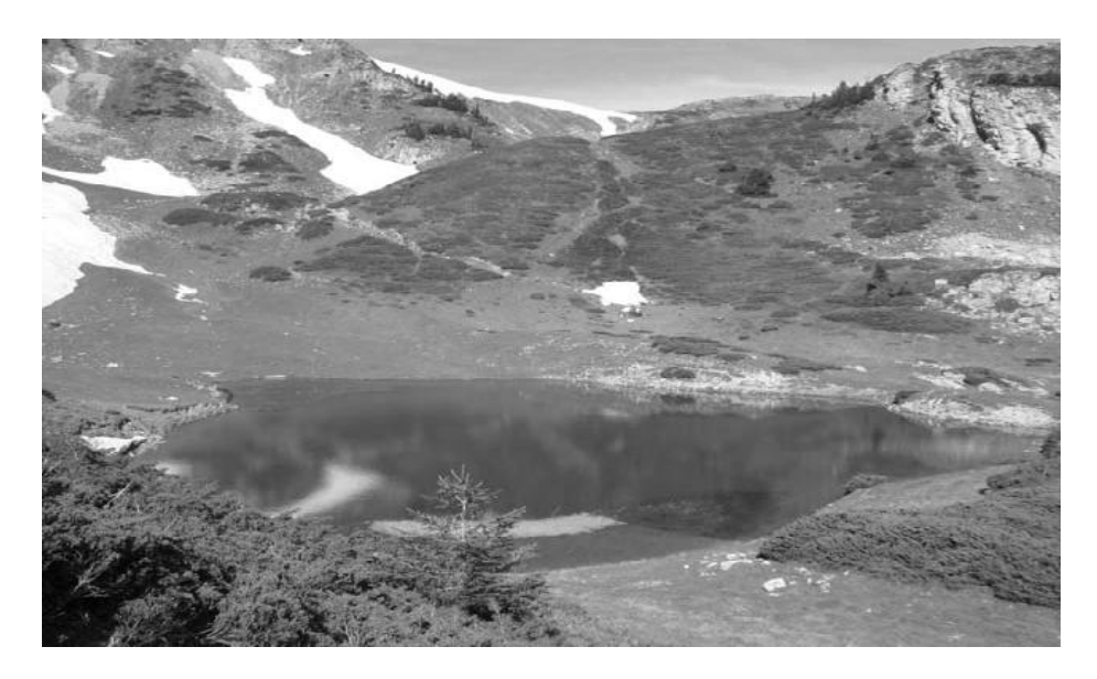
Figure 7 : Little Šiško lake - mystical silence the magnificent nature (www.visokogorcicg.com).

Great Ursulova ko Lake is situated near the rural settlement Kuriku e, therefore is also known as Kuriku ko Lake. The area mountain Bjelasica in which lake is located, is called Ursulovac, by the lake obtain behalf. It is located at an altitude of 1,895 m. length of the lake is 162 m, width of 106 m. The average depth is 2.9 m. Surface are Great Ursulova ko Lakes amounts to 12,200 m². About large above height, the lake water is cold, under the ice for about three months a year. Surface layer water temperature ranges from 12 ° S to 14 ° S. little Ursulova ko Lake is known as Blatina. Length of the lake is about 175 m, while the width is about 90 m. During the summer maximum Depth Lake is 2.2 m. Area of the lake varies from 5,000 m² to 10,000 m². Temperature surface layer of lake water is around 17 ° C. never not dries up, although the lake threatened by extinction. Lake serves as water trough for cattle (www.photomontenegro.me).