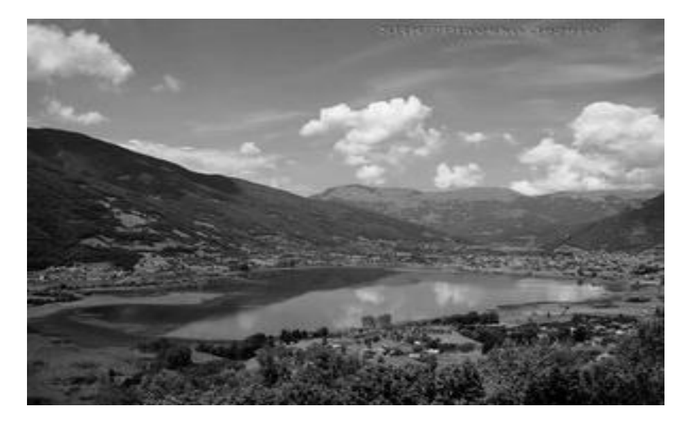
Figure 2 : Plavsko Lake-the largest glacial lake in Montenegro (www.plav.montenegro.travel).

Due to the isorganized development of tourism on the hydrographic objects lack of statistical monitoring of phenomena and processes, it is difficult to compare with other tourist values and determine their place in the tourist trade. In the previous development tourism these motives are not particularly respected. The lack of documentary material on air temperatures, isolation, rainfall height and duration of snow cover, cloudiness, and winds, water temperature is a particular difficulty in making the best of conclusions and concrete proposals for major tourism development. On the lake there is not even registering the service of tourists, tourist structures, and tourist traffic. Northeastern Montenegro, in the example municipalities Berane, Andrejevica and Plav is rich in lakes, mainly Glacier Lake by origin. As the largest and most important stands out the Plavsko Lake, and subsequently follows: Ridsko, Visitorsko, Peši a Lake, Great and Little Šiško, great and Little Ursulova ko. Plav Lake is lies between the mountain Prokletije and Visitor at an altitude of 906 meters, and provides the direction North-South in length of 2.16 km. It covers the area of 1.9 km<sup>2</sup>. Maximum width is 0.92 km and the depth of 9 meters.