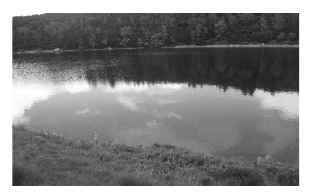
\label{eq:Figure 8: Great Ursulova} Figure 8: Great Ursulova \ ko \ Lake - located the highest altitude on the mountain \\ Bjelasica.