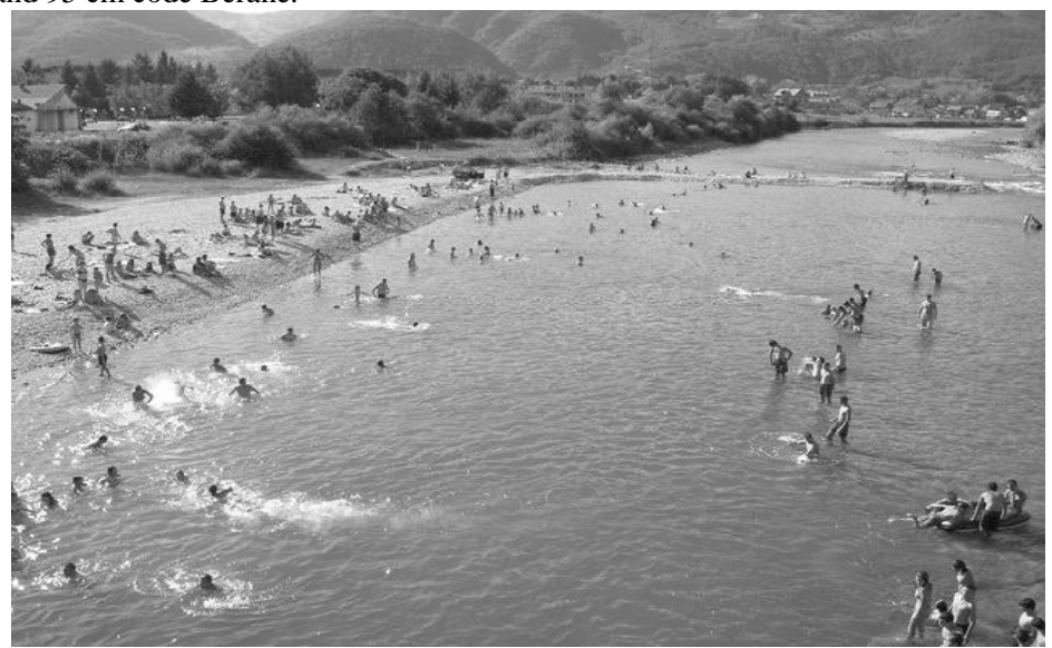
Figure 1 : River Lim - bathing on Lima is true experience (www.montenegro.travel ).

The backbone of the hydrographic network considered geo-space makes the Lim River and its many tributaries (Zlore ica, Kraštica, Gradišnjica, Šekularska River, Bistrica, Lju a, uri ka River, Komara a) and less (Veli ka River, Murinska, Vinicka, Dapsi ka, Lješnjica...). Lim river basin covers an area of 2,557 km2. Of these, the northeastern part of Montenegro belongs approximately 1304.1 km<sup>2</sup>, or about 51% of the total basin area. Lim springs from Plavsko Lake and flows through the considered Geospace on length of 57 km and a total drop are 265 m, respectively 6 m / km. On Lim have two water measuring stations in the Plav and Berane. Lim and its tributaries belong to the Dinaric Macedonian variant with the highest water in May, then April, June and March, and the lowest water in October and September. Annual water level on Lima amounts code Play 71 cm, 128 cm code Berana. Maximum monthly mean water level ranges from 106 cm on gauge station Play in May, to 184 cm also in the month of May, on gauge station Berane. The minimum medium monthly water is the code Play (48cm) and Berana (89 cm) out in September. The mean annual amplitude of water level code Plav is 58 cm, and 95 cm code Berane.