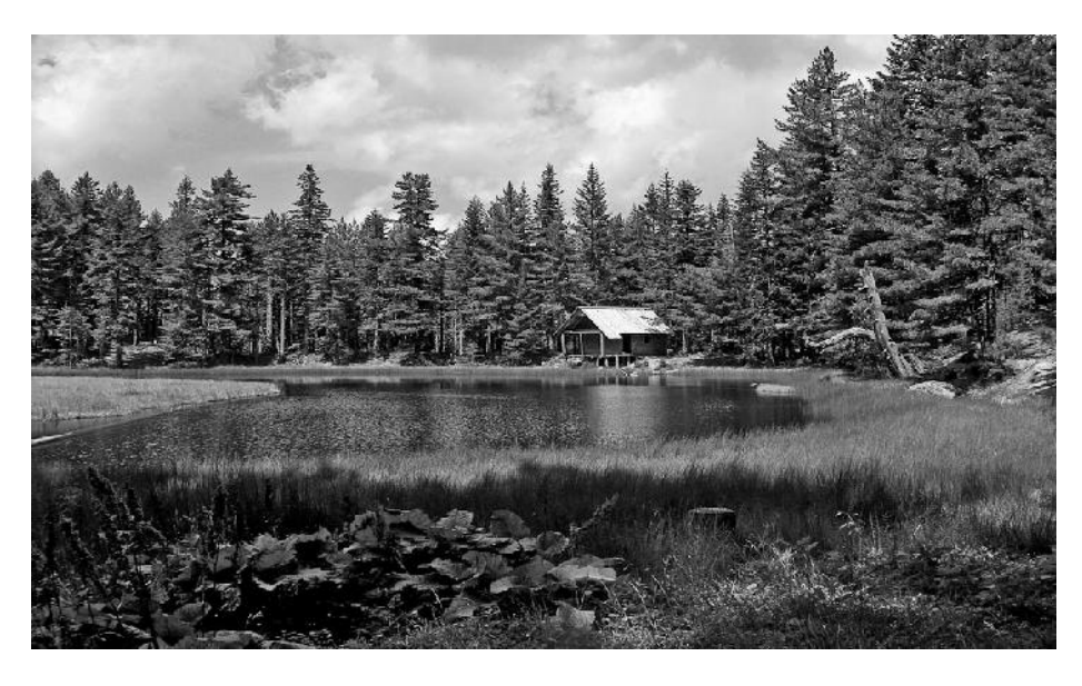
Figure 4 : Visitor lake- belongs group mountain lake better known as "mountain eyes" (www.stazeibogaze.info ).