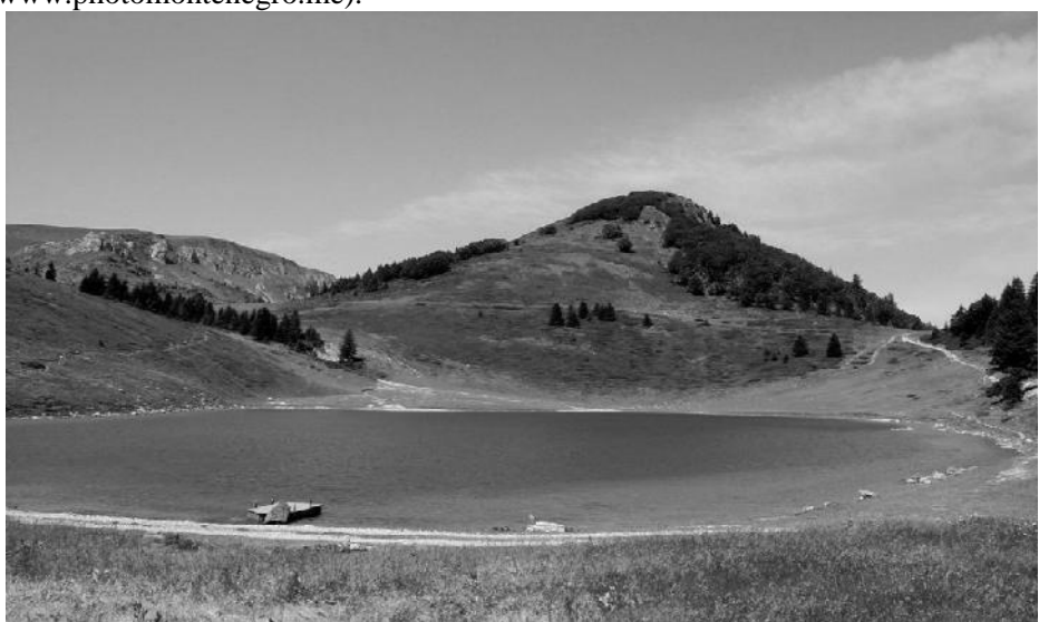
Figure 6 : Great Šiško lake-picture speaks more than words.

Peši a Lake is the second by size Lake in the area of the National Park Biogradska forest on the mountain Bjelasica. It is located at the foot of Crne Glave (highest peak Bjelasica), then Zekova Glave, Borove Glave and Cmiljeve Glave. The maximum width of the lake is 165 m, the average depth of 3.2 m (maximum about 8.4 m). Area of the lake during low water level is 37.400 m<sup>2</sup>. Length coast lines in are summer ranges from 750 m to 800 m (www.mojacrnagora.com). Great Šiško Lake the located in the area known by are name Šiška, after which the lake obtain behalf. It is located at an altitude of 1,660 m long is about 400 m and the depth of the lake at high water is about 3 m. It is surrounded by beautiful forests and summer pastures. Surface Great Šiško Lake is 29,080 m<sup>2</sup>. Temperature surface layer water in summer reaches about 20 ° C, and during the winter the lake under the ice. Near of Great Šiško Lakes (about 1 km) findings the little Šiško lake. Name itself indicates on is small lake about 105 m in length, width of 65 m. The maximum depth is 1.7 m. The lake surface is approximately 6,200 m<sup>2</sup>. Surface layer water temperature is around 20 ° C, while during the winter under the ice and snow (www.photomontenegro.me).