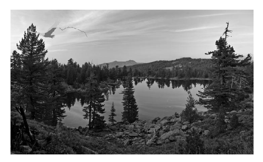
Figure 3 : Ridsko (Hridsko Lake) - considered being one of the most beautiful lakes in Europe.

Visitorsko Lake is situated on the mountain Visitora according to which is obtaining behalf. It is located on 1,820 meters above sea level. Surface lake amounts to 4,212 m², length 92 mm, and width of 73 m and a maximum depth of 4.1 m. According Stankovi (1975) the maximum temperature of is lake in July and August, ranging between 18-20°S. Length of coast of the line is about 300 m. For Visitor lake is characterized that the rapidly heats and cools quickly. At high water levels, the lake surface is increased to more than 5,000 m². Maximum water levels are in April and May, and a minimum in August and September. "Special curiosity of are lake is presence former" floating island". Legend says that are him raise cattle breeders of cut trees for raft. During the night, on a raft would with cattle go from the coast. Raft is overgrown with grass, with the mainland is connected felled by pine trees "(www.montenegro.travel).