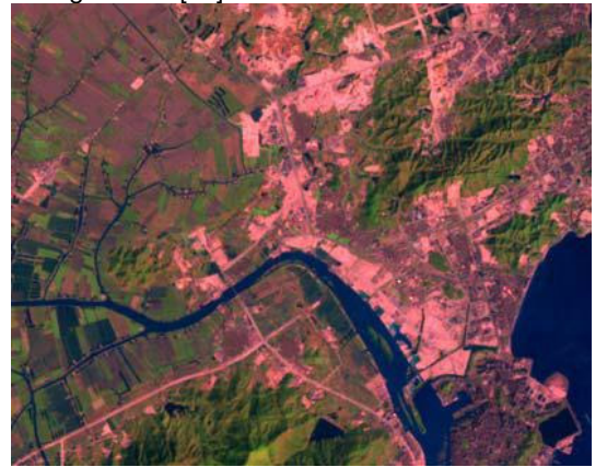
Fig. 4- Imagery taken in 1992

Figure 4 to 7 show [10]. From vision effect, land type change is firstly represented as grey level change, and texture can only accessorily discriminate partial types such as town and plantation in agriculture lands. So change detection should use imagery's grey levels, texture, or other information selectively and orderly in order not to impair precision of change detection. Proper procedure describes as follows. Imagery should be pre-processed necessarily at first such as geometric rectification, radiometric correction and spectral similarity analysis. Then primary result of change detection is achieved after ANN based change detection, and improvement can be made according to result of elementary detection and spectral similarity analysis. At last, wavelet texture featured quantity and other auxiliary geodata can help to validate change of land types. Figure 4 and Figure 5 show two temporal imagery of the same area. Figure 6 and Figure 7 show change detection result and changed area [13].