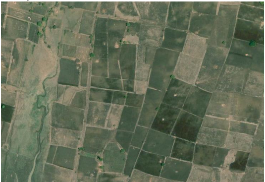
Fig. 1- Google image (April 2004)

The both figure 1 and 2 are of from same projected area and captured in different time slots;