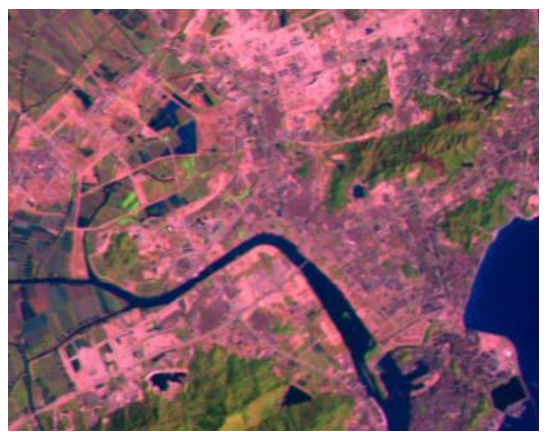
Fig. 5- Imagery taken in 1996