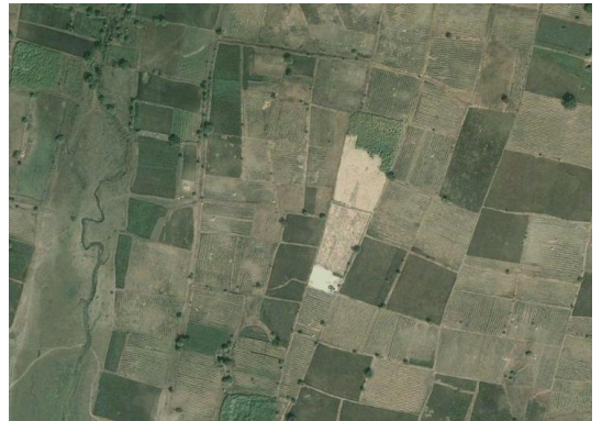
Fig. 2- Google Image (December 2006)