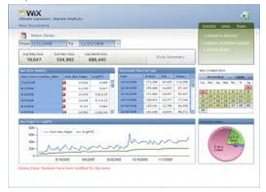
Fig. 2- Web Analytics Dashboard

Dashboards are a powerful way of monitoring websites and distributing information to different target groups. However, they can be difficult to design, because successful designs require deep insight into the needs of the target groups as well as into the field of web analytics.