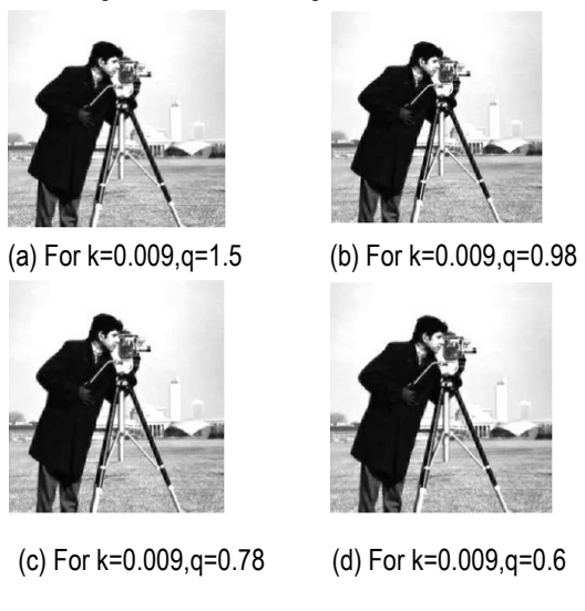
Fig. 7- Recovered images using 2-level discrete wavelet transform for various values of scaling factors q

The values of the MSE and PSNR are calculated for various values of the scaling factors k and q for both 1- level DWT and 2-level DWT as shown in Table 1 and Table 2.