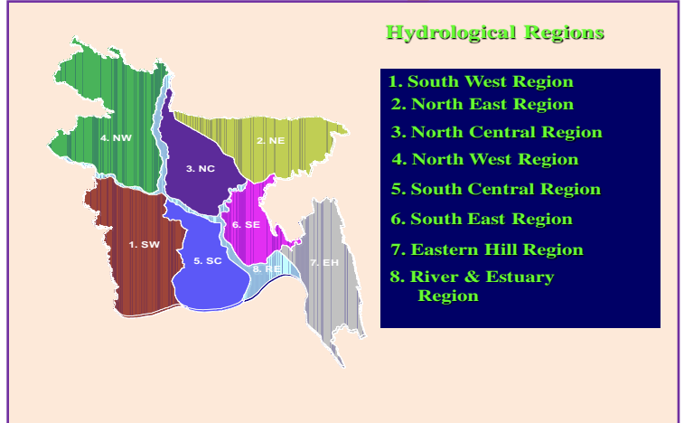
Figure 3: Hydrological Regions of Bangladesh

The government of Bangladesh has to be established a competent authority for each of the hydrological regions to co-ordinate the implementation of the NWPo and NWMP within it. These competent authority will be the branch office of WARPO and WARPO will act as a co-ordinating body for these competent authorities. The competent authority will be responsible for implementing the River Basin Management Plan within each hydrological region designed by NWMP. This theme can be called as decentralization of WARPO, based on hydrological region. The Government of Bangladesh (responsible organization is the Joint River Commission, Bangladesh) will endeavour to enter into agreements with coriparian countries (India, Nepal, China, Bhutan and Mayanmar) for sharing the waters of international rivers, data exchange, resource planning and long-term management of water resources under normal and emergency conditions of flood, drought and water pollution. While moving towards the attainment of basin-wide plans in the long run, it is necessary for Bangladesh to concentrate on the development of these individual hydrological Regions to meet short and intermediate term requirements. This way WARPO will work close contact with JRC for trans-boundary water issue.