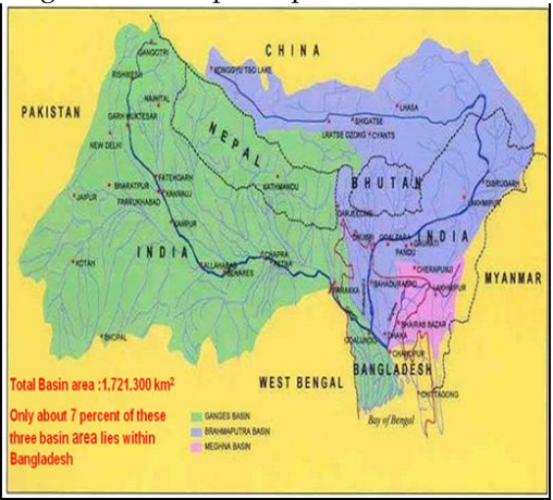
Figure 1: Geographical Location of Bangladesh Figure 2: The GBM River Basin (http://www.mapsofworld.com/bangladesh; JRC, Bangladesh- www.jrcb.gov.bd)

For minimizing the adverse impact in Water Sector Bangladesh, the country has done lot of studies and has taken lot of programs chronologically for systematic Water Resources development and Management.