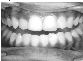
Figure 6: Crown on Fractured Incisor Given (Post – Operative)

After root canal treatment and composite build up of the fractured tooth, crown cutting of the teeth was done as shown in (Figure 5). After the crown cutting impression was taken and sent to the laboratory for the processing of Porcelain fused to metal crown. The crown was fixed with the help of luting cement i.e GIC TYPE 1 as shown in the (Figure 6).