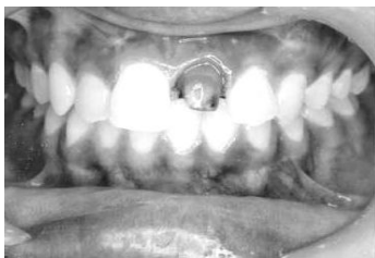
Figure 5: Crown cutting of tooth done (Operative)

After root canal treatment and composite build up of the fractured tooth, crown cutting of the teeth was done as shown in (Figure 5). After the crown cutting impression was taken and sent to the laboratory for the processing of Porcelain fused to metal crown. The crown was fixed with the help of luting cement i.e GIC TYPE 1 as shown in the (Figure 6).