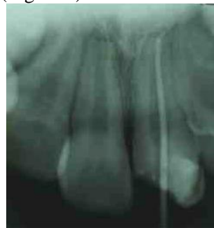
Figure 3: IOPA showing working length x-ray

An infraorbital block was administered for 11, 12. The pulp chamber was opened using no. 330 round carbide steel bur & working length determination IOPA was taken with a no. 10 K-file (Figure 3).