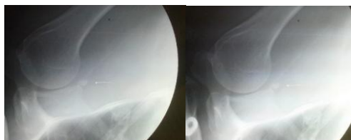
Figure :1(X Ray Left Shoulder)

spine bilateral lateral flexion bilateral rotation and flexion were full and pain free. However, the left shoulder pain could not be reproduced by the neck examinations (i.e. range of motion, soft tissue palpation, Spurling's, Jackson's and maximal compression tests). Her active left glenohumeral ROM was; flexion 0 - 80°, abduction 0 - 45°, external rotation 0-10° and internal rotation 0 -20°. The left glenohumeral joint passive ROM was 5 degrees more in each direction. Posterior and posteroinferior glide restricted and painful. The resisted left glenohumeral joint flexion, abduction, internal and external rotations were graded 3/5. Her left deltoid, infraspinatus, supraspinatus and teres muscles were spasmodic and tender upon palpation. There was severe point tenderness over the left deltoid tuberosity and the rotator cuff. Special tests such as painful arc (pain and weakness between 60-120 degrees shoulder abduction), Empty can test (Barr, 2004), Hawkins Kennedy impingement test (Barr, 2004) was positive and Drop arm test was negative.