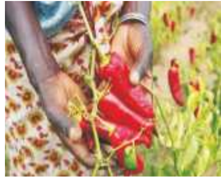
Capsicum annum L (Paprika)