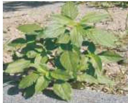
Amaranthus lividus (Bonongwe)