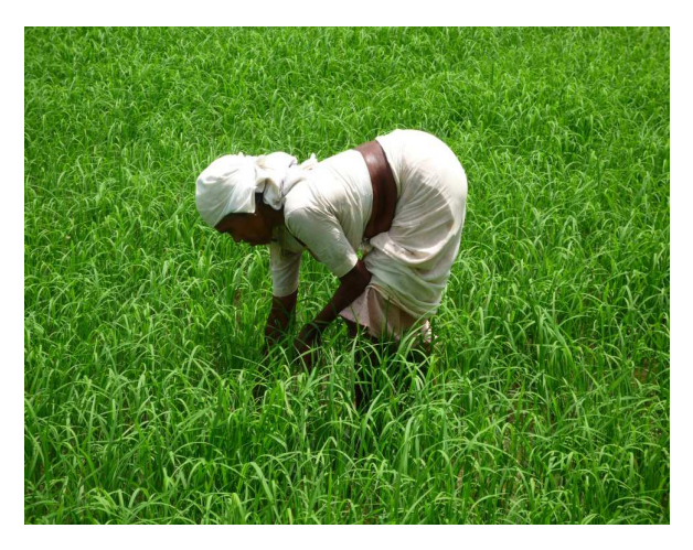
Conversely, when is a paddy too small for an herbicide application by air?

However, SRI is not the answer in all rice production systems. When does SRI fail to be practical because of the size of the field or availability of labor? When is a paddy too large for manual weeding? What then are the alternatives?