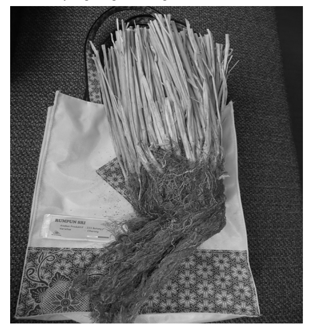
Fig. 1. Rice plant (Ciherang cv.) with 223 tillers grown from single seedling with SRI methods. Presented to author by farmers at Panda'an training center in East Java, Indonesia, October 2009.

Rice plants grown with SRI methods have more tillers per plant, commonly 30 to 50, and as many as 80 to 100, and sometimes even more with the best use of these practices (Fig. 1). While the percentage of panicles (tillers that become fertile and bear grain) usually declines somewhat as the number of tillers goes up, there is a visible increase in the number of panicles per rice plant with SRI methods. Effective, i.e., fertile, tillering is usually in the 70-90% range.<sup>6</sup> To be sure, with wider spacing there are fewer plants per square meter. But with a betterdeveloped root system (see below), there are more fertile tillers per unit area and also larger panicles, with usually higher grain weight.