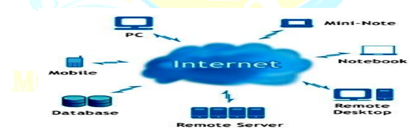
Fig. 2 – Computing paradigm

The most important part of the whole process is to have internet access. You can access all your data and information anywhere and at any time through an internet connection. Cloud provider establishes both hardware and software necessary to run your both kind of (home or business) applications. This is especially helpful for businesses that cannot afford the large amount of hardware and storage space as like in big company. Small companies can store their information in the cloud, reducing the cost of purchasing and storing memory devices [8]. Additionally, because you only need to buy the amount of storage space as per your requirement, an organization can purchase more space or reduce their subscription as their business grows or as they find that they need less storage space [8].