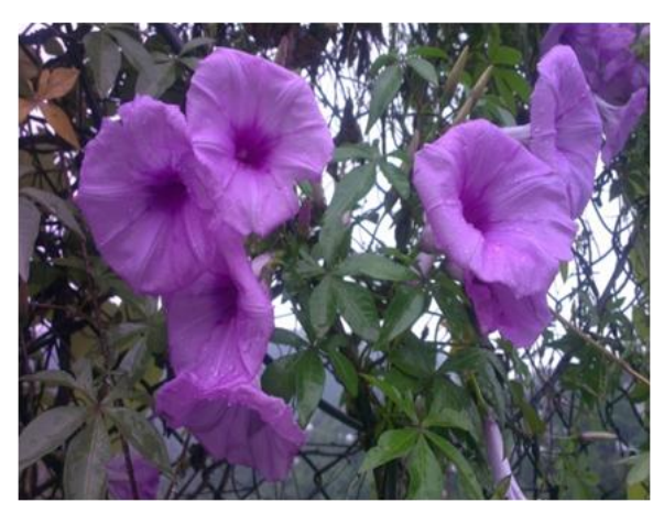
Figure 2. Ipomoea cairica

The dried powder materials of the leaves and flowers were defatted with petroleum ether (60 –