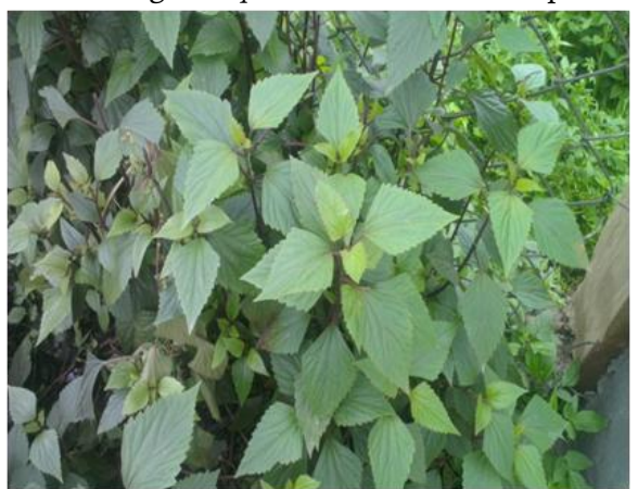
Figure 1. Ageratina adenophora

Ipomoea cairica (Fig. 2) is a vining perennial herb from the Convolvulaceae family growing from a tuberous footstock. It is a prostrate creeper or twining into other vegetation and has large palmate leaves with 5 – 7 lobes with showy white to lavender colour flowers. Each fruit matures at about 1 cm across and contain hairy seeds. The genus Ipomoea occurs in the tropics of